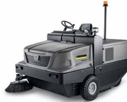
KM 170/600 R D CLASSIC